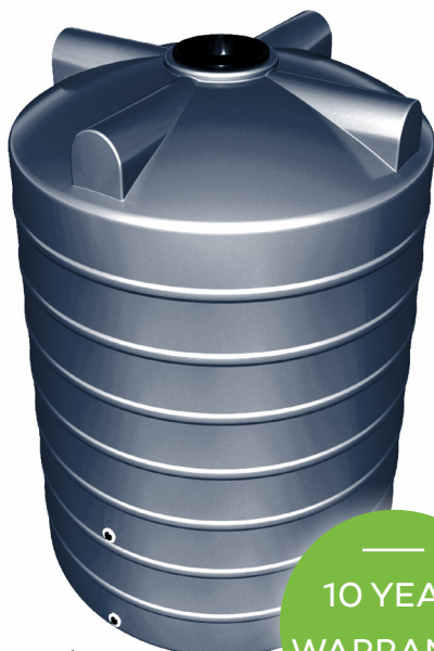
Shown in Bluestone