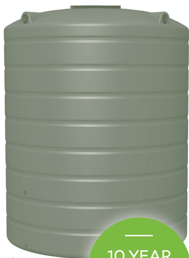
Shown in Rivergum