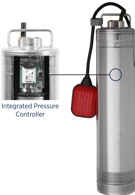
Integrated Pressure Controller