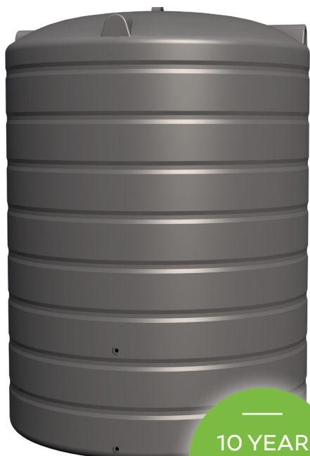
Shown in Basalt