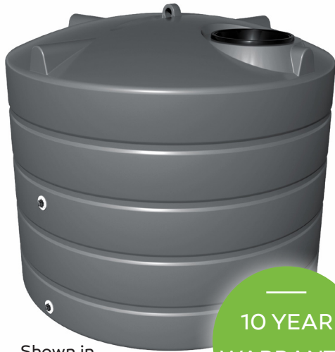
Shown in Slate Grey