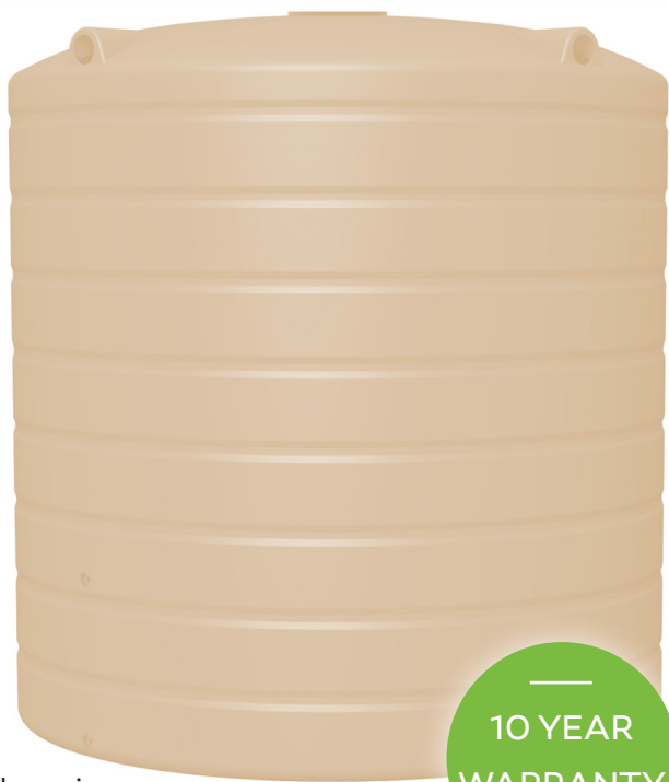
Shown in Wheat

Built to the highest of Australian standards, this round water tank has been designed to be durable, in order to withstand the harsh Australian weather.